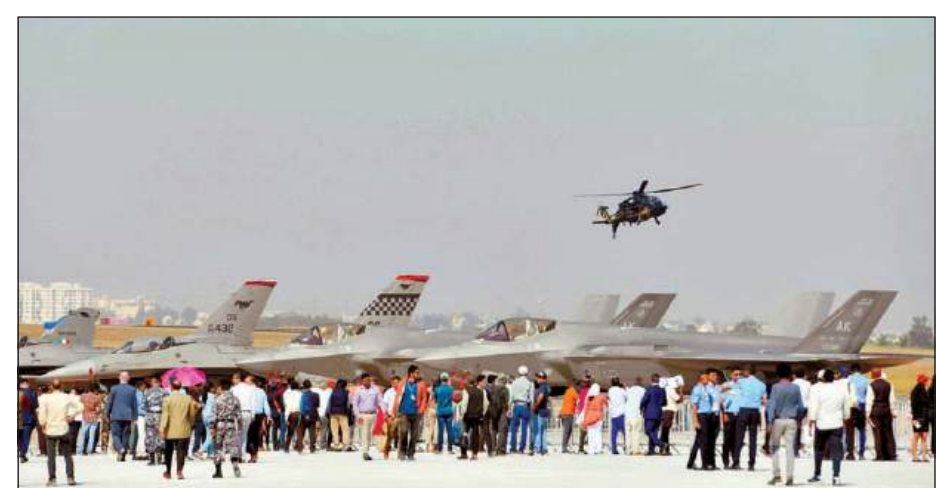
Visitors at the Yelahanka air base to witness the ongoing Aero India 2023, in Bengaluru on Tuesday.

Though the reasons behind the ITD's survey' or what the sleuths were looking for are not clear, it is widely suspected to be a fallout of the recent documentary 'India: The Modi Question' on the 2002 Gujarat riots aired by BBC that rankled the Indian gov-